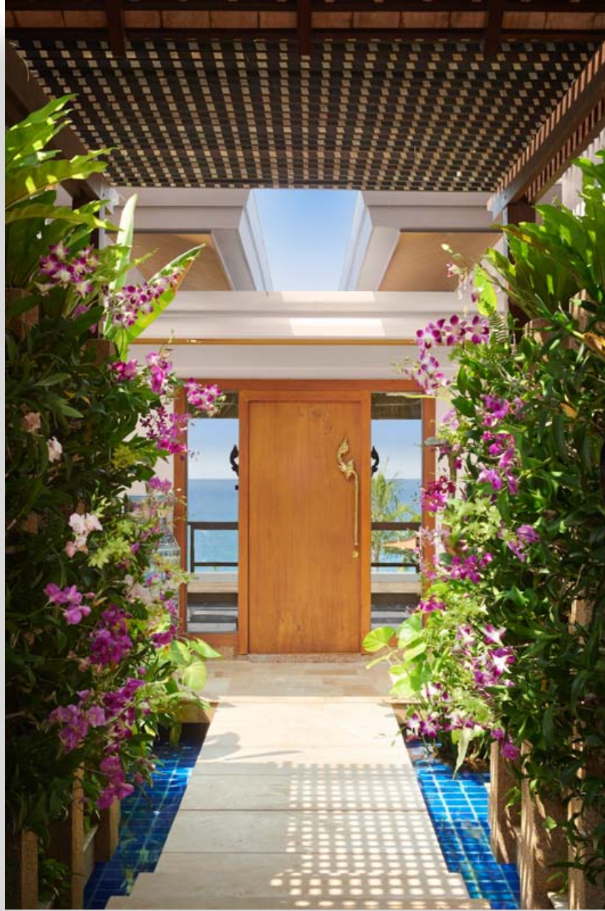
Slender teak wooden beams shade a lush vertical orchid garden at the entrance of Baan Kata Villa B6. Surrounded by tropical beauty, large marble steps lead over a pond filled with water plants and graced by a small waterfall duct that welcome guests to the front door.