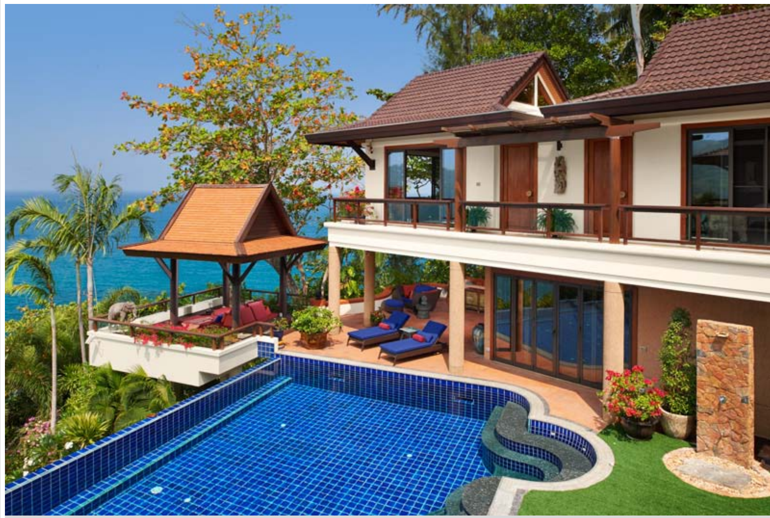
Gorgeous viewpoint of Baan Kata's infinity iridescent blue tiled pool with marble steps and border, outdoor granite stone shower and sea front sala lounge. Also, shows the 2 guest rooms on the upper level of this unique U shaped oceanfront villa.