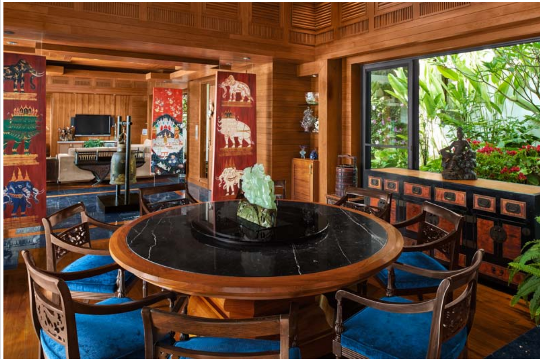
Vantage viewpoint of the spacious dining room with 10 seat marble top and wooden trim dining table and upholstered velvet chair seats with wooden frames. Past this room, is the marble foyer with beautiful wooden panels painted by a famous Thai artist which connects to the living room. Looking out dining room glass doors toward the wood decking and the entrance pond adorned with water plants and mini waterfall.