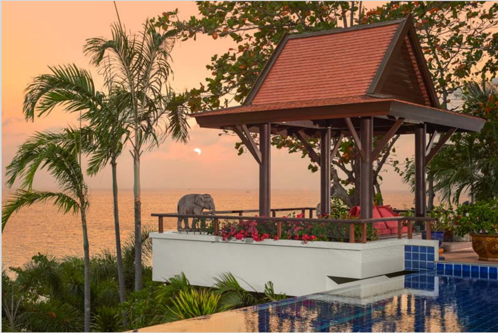
Close-up of the rejuvenating open-air sala lounge on columns that allows one to relax and revel in the 180 degree Andaman sea view and Kata Noi shoreline while enjoying a tropical orchestra of wind, water and waves.