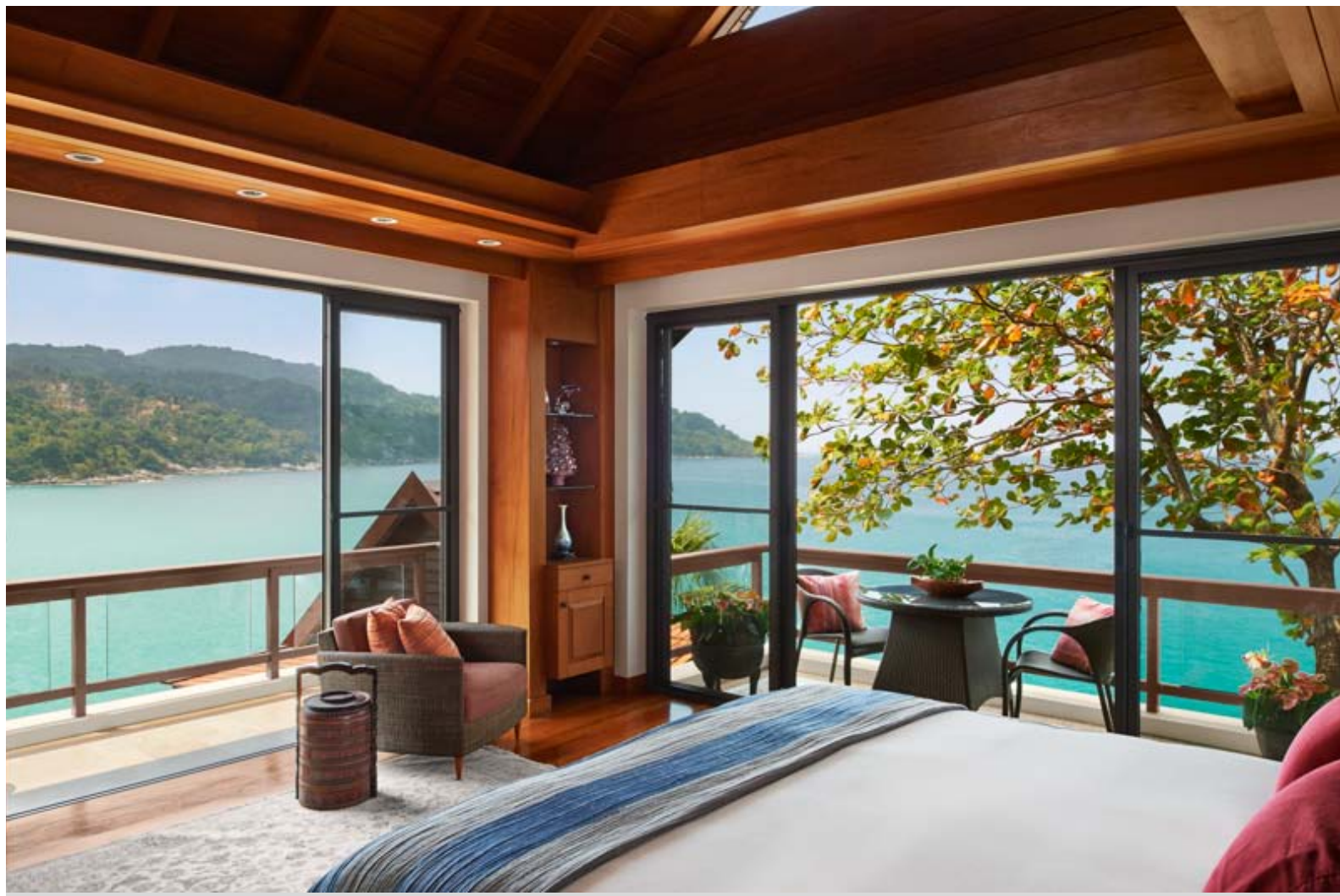
Spectacular serene and spacious sea view (2 walls with large glass sliding doors) guest bedroom with king size bed on the upper level with its private terrace. Room also has en suite marble shower bathroom.